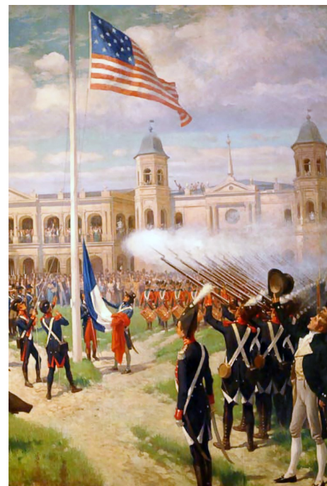
Flag raising in the Place d'Armes of New Orleans, marking the transfer of sovereignty over French Louisiana to the United States, December 20, 1803, as depicted by Thure de Thulstrup, 1904