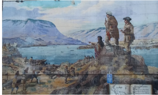
Mural depicting the Lewis and Clark expedition in downtown The Dalles, OR

are interested in the Friday, June 7 th or Saturday, June 8 th , or both nights.