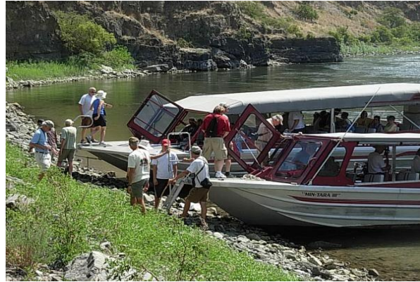
Jet boats at Ordway site