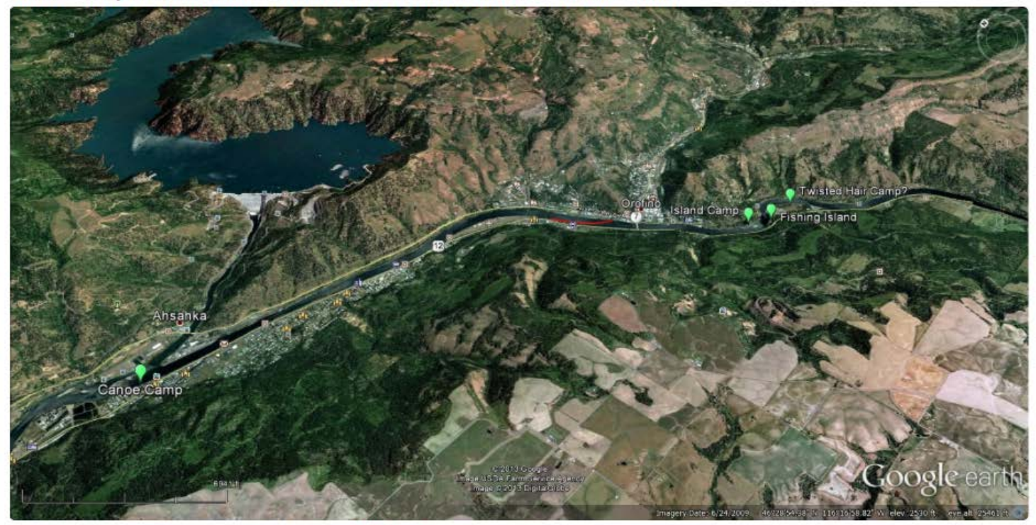
Figure 1. Bird's Eye view of the Orofino area. Full-size image

The Corps of Discovery first entered the Orofino area when Capt. Clark accompanied by three expedition members arrived late in the evening of September 21, 1805 at Twisted Hair's camp just up river from Orofino. The next day they returned to Weippe area and then returned with the whole expedition on the 24th. By the 25th many men were sick. Clark, with Chief Twisted Hair and two young Nez Perce men headed down river to hunt trees "Calculated to build Canoes." They traveled down the north side of the river to mouth of the North Fork.