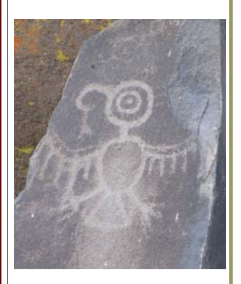
One of many petroglyphs seen by chapter members on the Gorge Wildflower Tour in April.