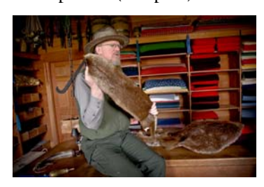
Fort Vancouver park ranger explains fur trapping and trading at the company store during the February tour.

guiding. We toured the Washington side, focusing mostly on Catherine Creek and two other smaller waysides, including the Major Creek campsite. (see p. 4)