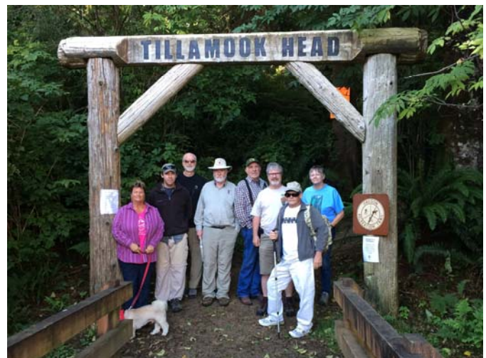
The intrepid Oregon and Washington Chapter hikers gather at the north trailhead at Seaside. The 7-mile hike was quite challenging in places, but rewarded them with historic and panoramic views.

We saw WWII-era radar/observation bunkers and looked out toward the point of Clark's Point of View (Bird Point) and Tillamook Rock Light-house. As we proceeded on we saw views of the Clatsop Spit and Clark's Mountain before descending to the north trailhead to retrieve cars.