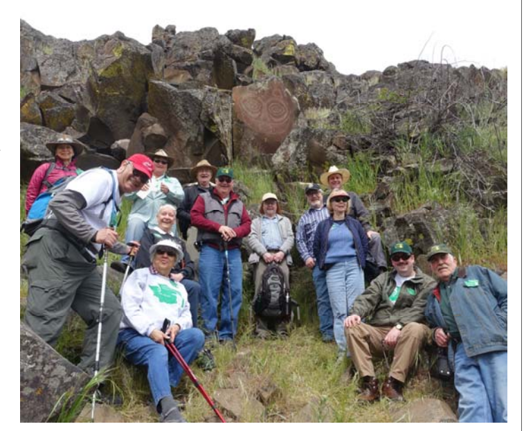
Intrepid chapter members visit Tsagaglalal —"She Who Watches", the famous pictograph, in an Explore More event in April, 2017.

Watch this newsletter, your mail, your e-mail, and especially the chapter website for more information and details.