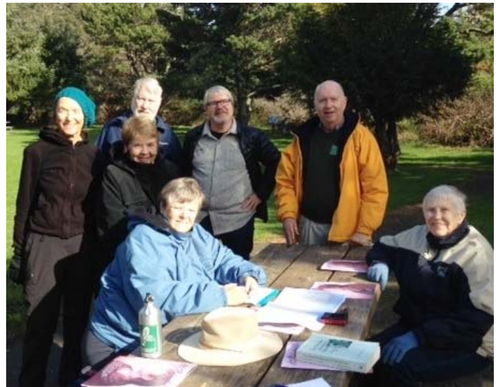
Several Chapter members gathered at Les Shirley Park on the Oregon Coast in March to get an update on 2018 Annual Meeting plans, followed by a field trip into Ecola State Park and to NeCus Park.

Watch this newsletter, your mail, your e-mail, and especially the chapter website for more information and details.