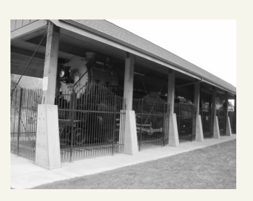
Old No. 2507

to visit the former site of Celilo Falls, now submerged by the impoundment of The Dalles Dam