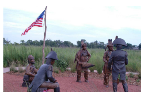
"First Council" statues - Ft. Atkinson