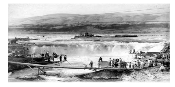
Fishin' at Celilo Falls

Watch "Lost Echoes of Celilo Falls" on YouTube.com