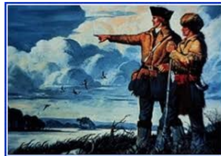
Fonda and Wayne?