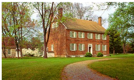
Locust Grove - Louisville, KY