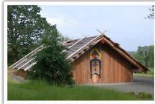
Cathlapotle Plankhouse www.ridgefieldfriends.org

the natural and cultural history of the area.