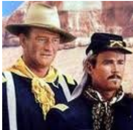
John Wayne and Henry Fonda in Fort Apache