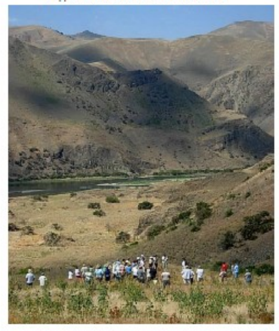
Cougar Rapids Bar - site of Nez Perce village, 1806