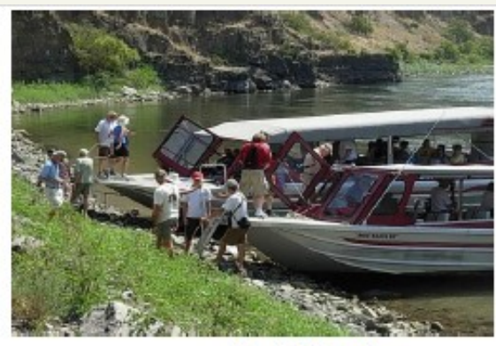
Jet boats at Ordway site

or Chuck Raddon, 208-476-3123 or idahoclarkie@gmail.com