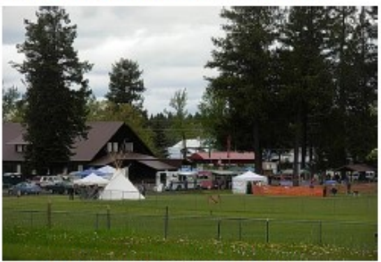
Weippe Camas Festival - small town Americana