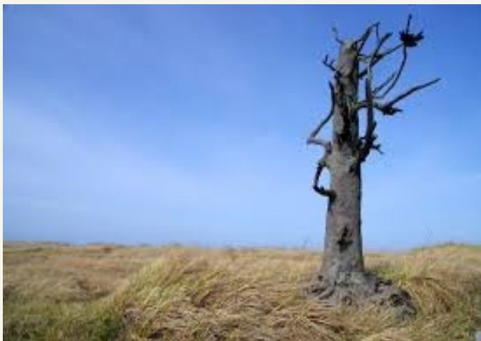
Clark's Tree sculpture, Long Beach WA

Part of this article is reprinted from the website of the National Park Service and the Lewis and Clark National Historic Park. - Eds.