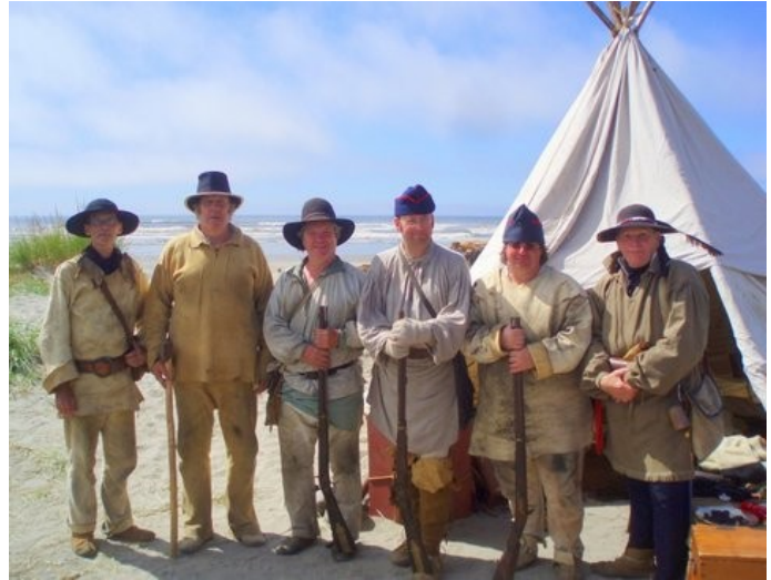
Pacific Northwest Living Historians