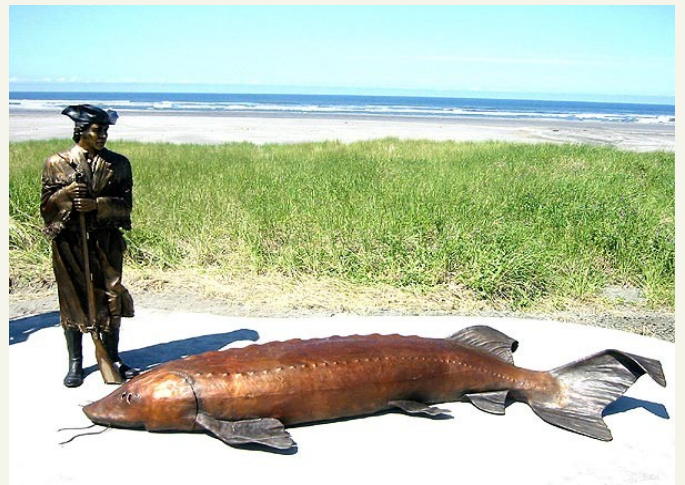
Capt. William Clark sculpture, Long Beach WA