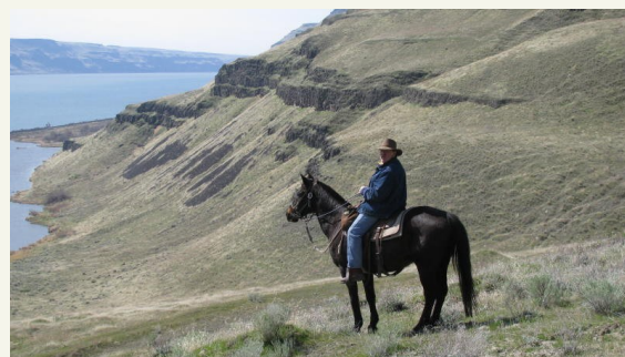
Doc in the saddle

Silent Auction: all attendees are encouraged to bring items to donate for the silent auction, with the proceeds going to the Chapter.