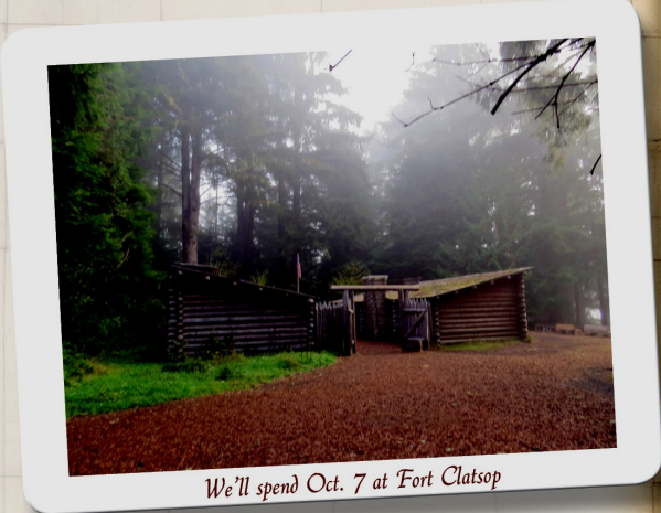
We'll spend Oct. 7 at Fort Clatsop