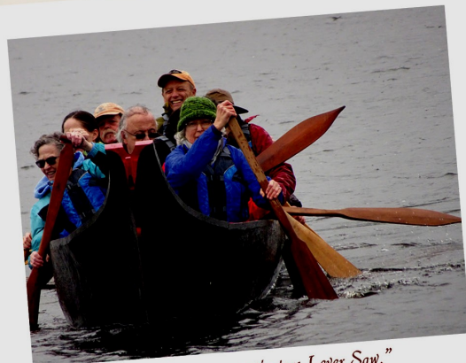
"...the best canoe navigators I ever Saw."

But since you are coming by land, plan on two hours from Portland to Astoria by several different routes: rental car recommended; ride-sharing encouraged; potential shuttle service options will be announced via www.or-lcthf.org . Commercial bus service also available. Plan to come early and stay late to see much more than we can offer in four days. Email Glen Kirkpatrick with questions: Glen.Kirkpatrick@or-lcthf.org .