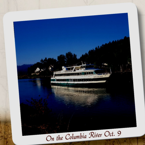
On the Columbia River Oct. 9

* Email Larry.McClure@or-lcthf.org in advance if you are interested in these opportunities.