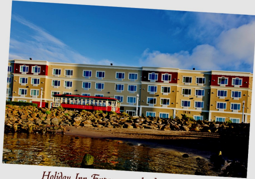
Holiday Inn Express, our headquarters hotel